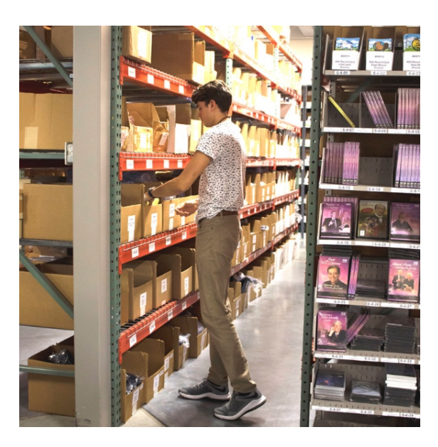
Advent Source, the official ministry supply center for the Seventh-day Adventist Church in North America, became an NAD institution on Nov. 9, following a vote by the NAD Corporation Board. MORE

The Camp Fire, now considered the deadliest fire in California's history, has claimed the lives of close to 60 in the Concow and Paradise vicinities. According to news reports, more than 52,000 were evacuated from the area; about 8,800 homes have been destroyed. Nearly 1,300 Adventist church members have been affected; and several Adventist properties have been destroyed or sustained serious damage. MORE