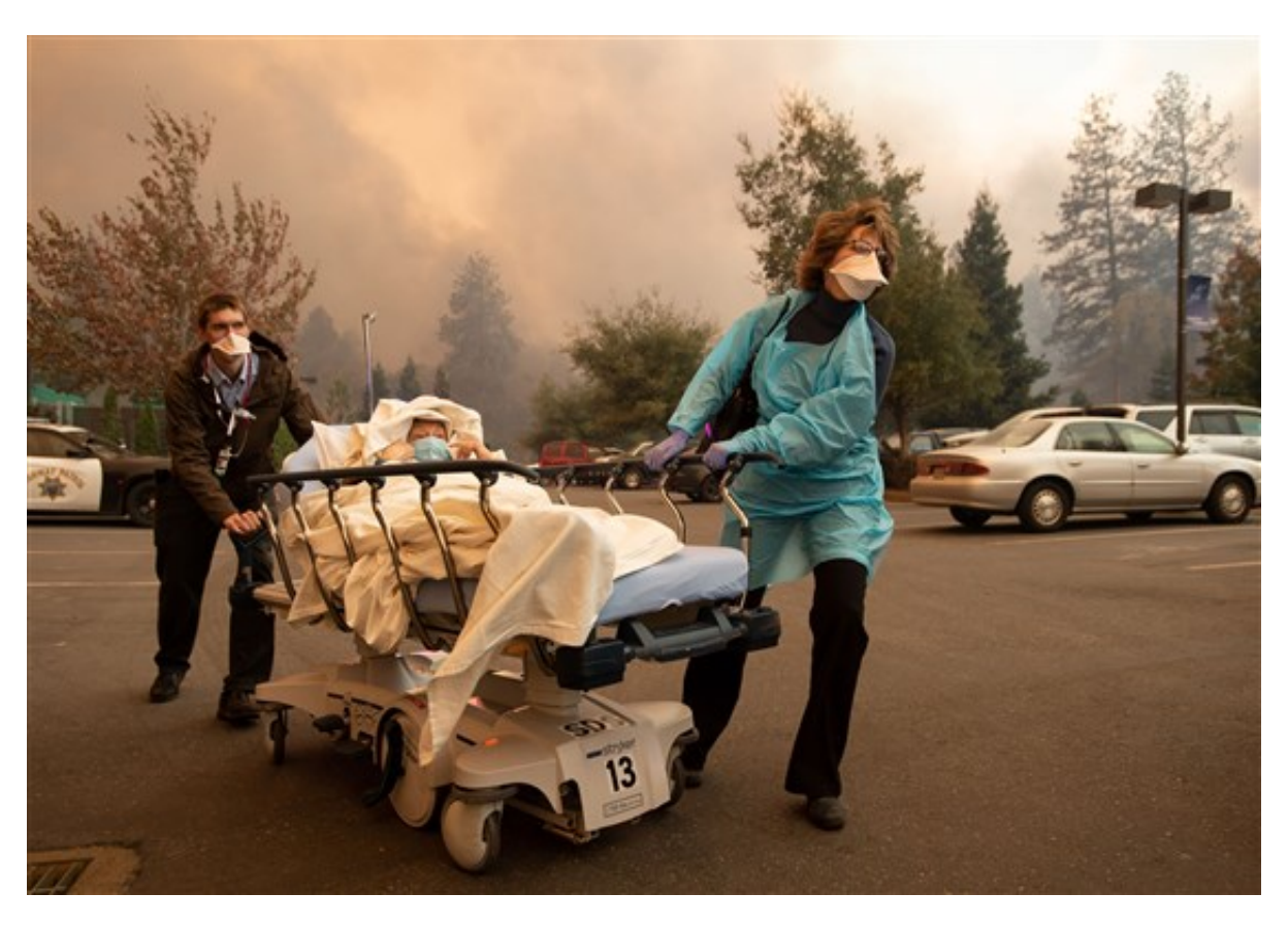
Photo: Adventist Health Feather River staff evacuates patients as the Camp Fire in Paradise, Calif., drew near the hospital, which miraculously survived the fire. (Josh Edelson/AFP - Getty Images) Source: <a href="NBC News">NBC News</a>